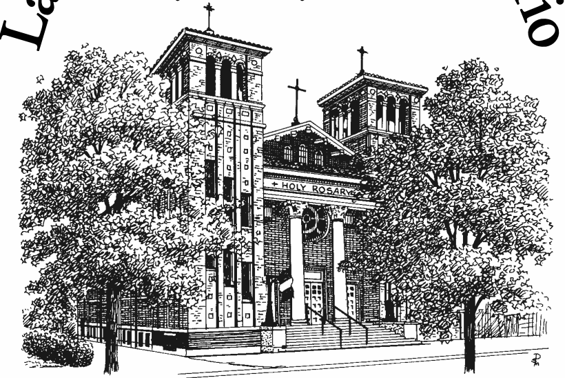
The Italian Parish of Indianapolis