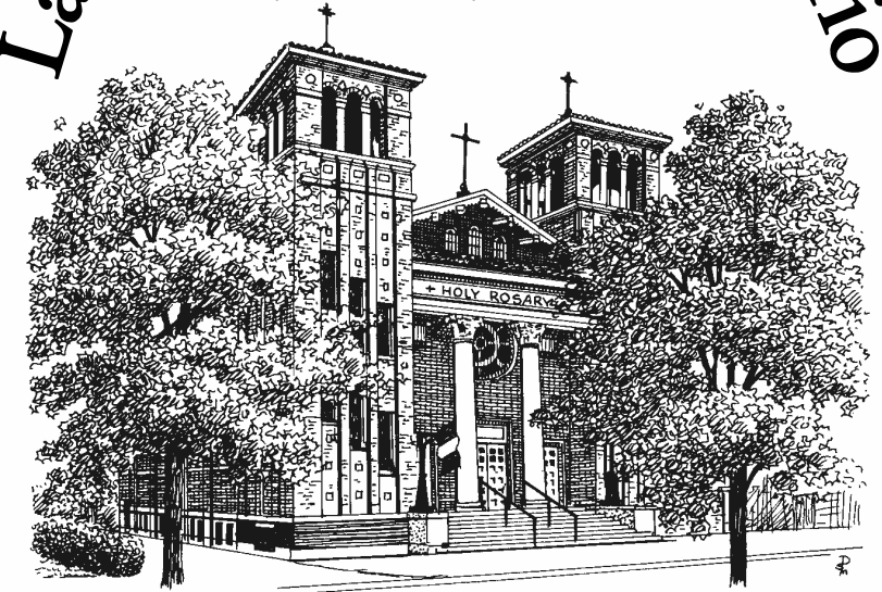
The Italian Parish of Indianapolis

La Chiesa del Santo Rosario Holy Rosary Church