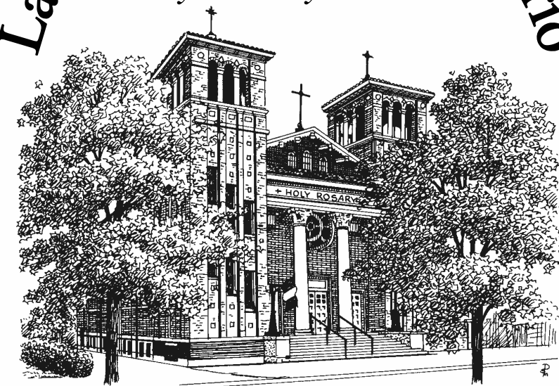
The Italian Parish of Indianapolis